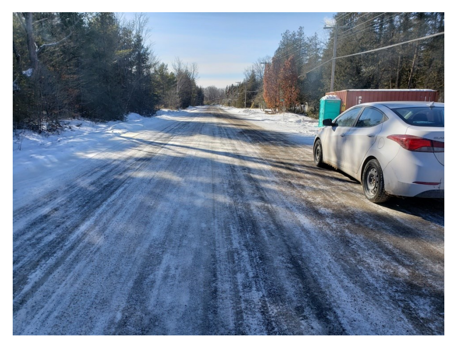
Birchview Road – south east view