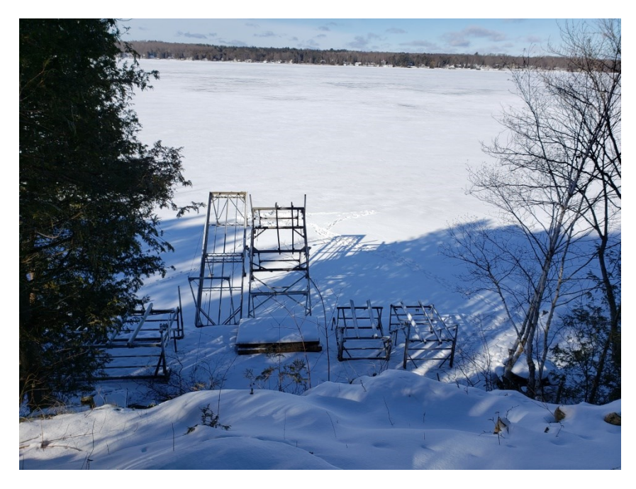
View of Clear Lake from existing dwelling