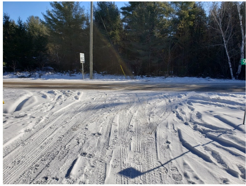
Entrance/driveway from Birchview Road