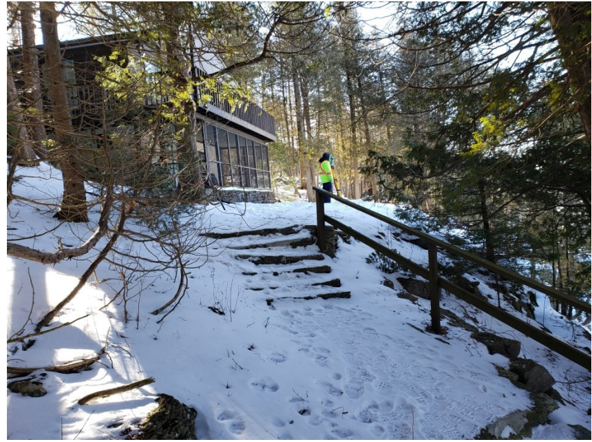
View of existing dwelling from stairway leading to the water