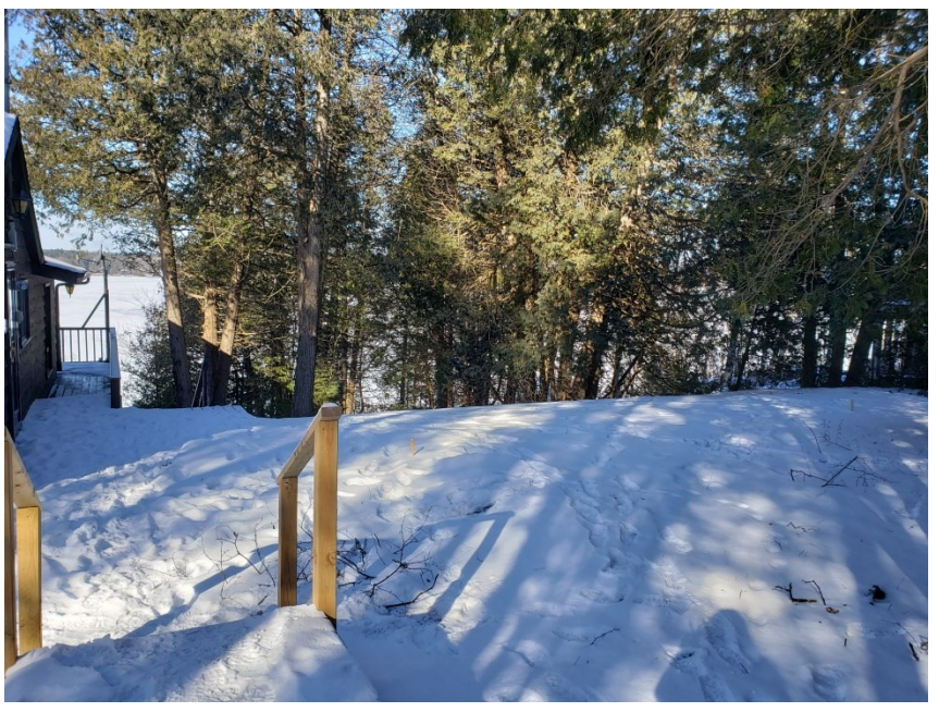
Existing dwelling with stairs