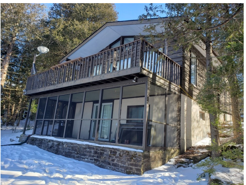
Existing dwelling – east view