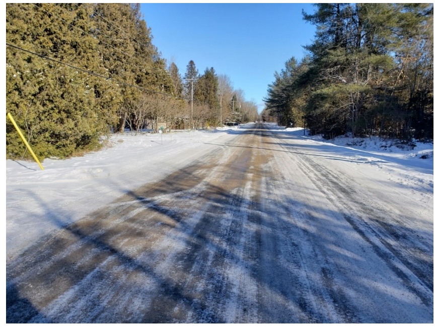
Birchview Road – northeast view